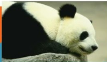
Pandas live on the eastern edge of the Plateau of Tibet